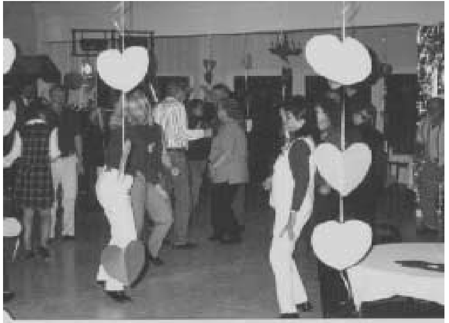
Lake Royale residents enjoyed themselves at the Valentine dance at the clubhouse last month. The next big event planned by the Recreation Committee is the adults-only Mardi Gras Dance set for March 24