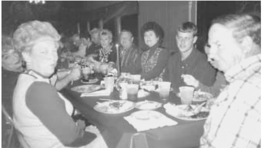
ENJOYING A FEAST — Lake Royale property owners and their families enjoy the annual Thanksgiving Feast, held on Nov. 20 at the lodge. The Property Owners Association provided the turkey, ham, and drinks, and families brought covered dishes and desserts to share with their neighbors.

Your cooperation with this endeavor is appreciated. The Welcoming Committee members all hope this new phone directory will fill a niche in our community.